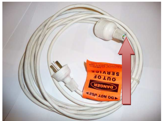
"light duty" extension lead – blue & green wires showing

Is your workplace electrically safe? Don't let the answer shock you!