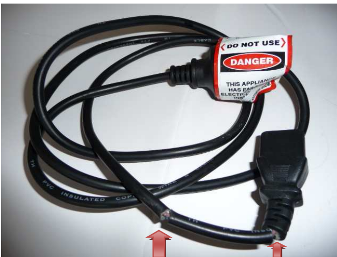
Computer Power lead with cuts in the black outer insulation