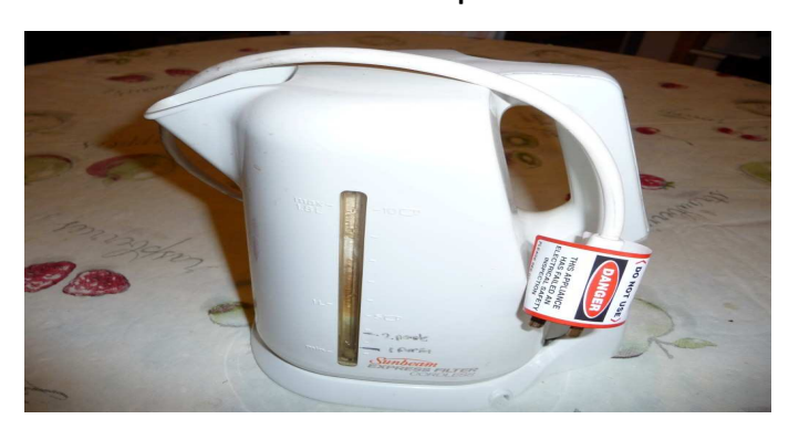
FAILED Kettle - earth resistance exceeded the safety limit

*Remember you cannot always see an electrical fault*