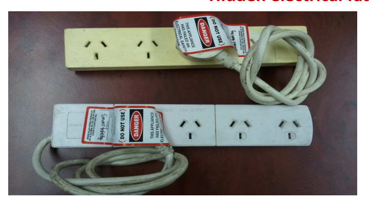
FAILED - Power boards have broken parts inside