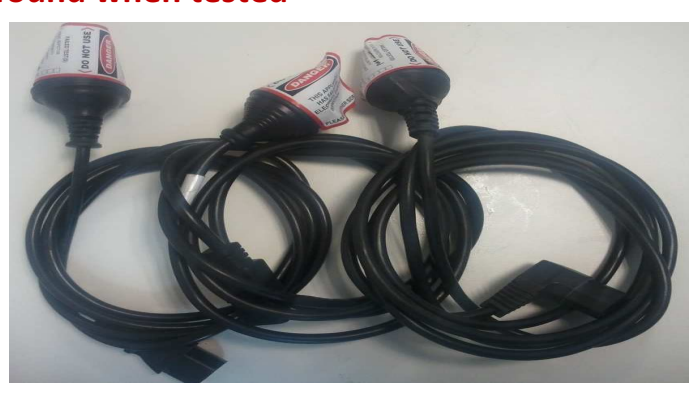
FAILED an earth bond test - Computer IEC Power Leads