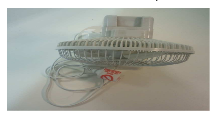
FAILED Desk Fan - slow speed switch not working