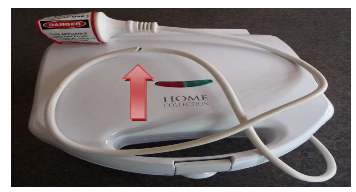
FAILED - Sandwich Toaster has a melted lead