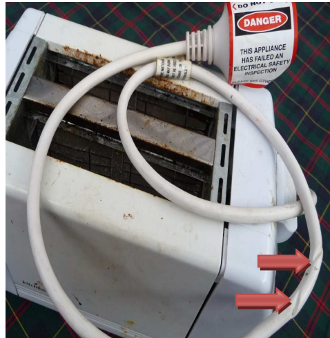
* Damaged Lead (melted)