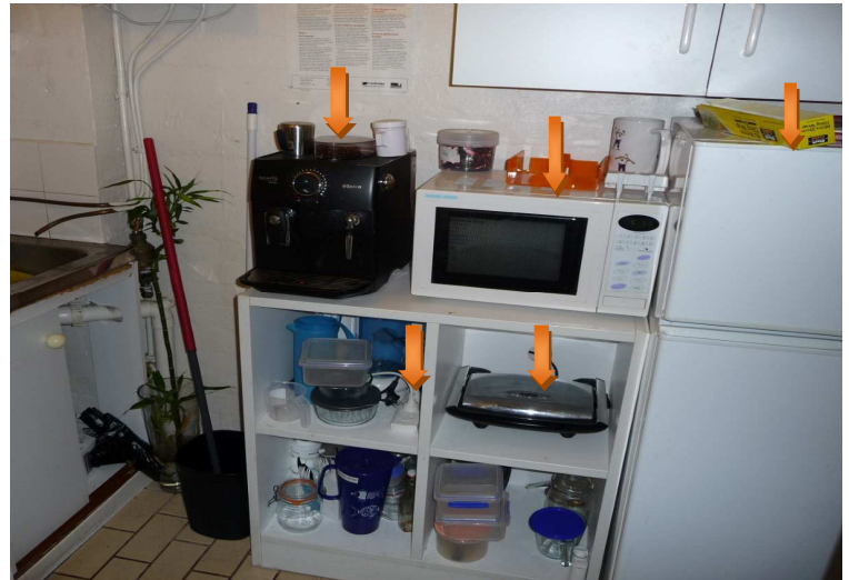
This kitchen has 5 electrical appliances plugged in