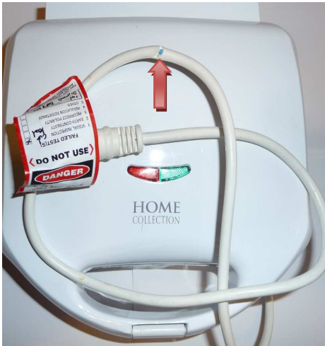
* Damaged Lead (melted)

During test & tagging, the following workplace kitchen appliances FAILED a safety inspection.