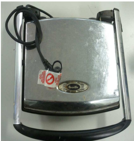
* Grill FAILED an earth bond test