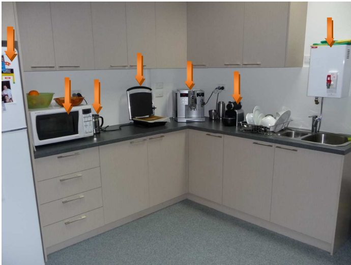
This kitchen has 7 electrical appliances plugged in