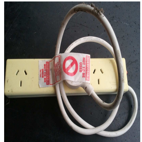
* Powerboard FAILED an earth bond test

You only want to toast your lunch, not yourself.