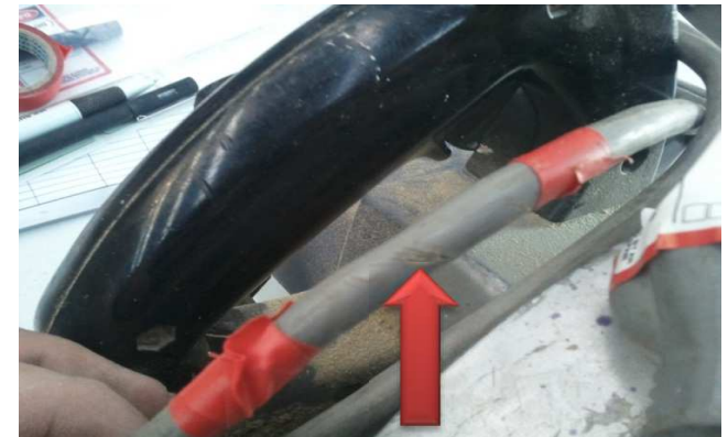
* Tag WS037 Saw FAILED - Damaged Lead