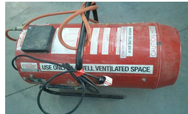
* Tag WS040 Jet Heater FAILED an Insulation Test