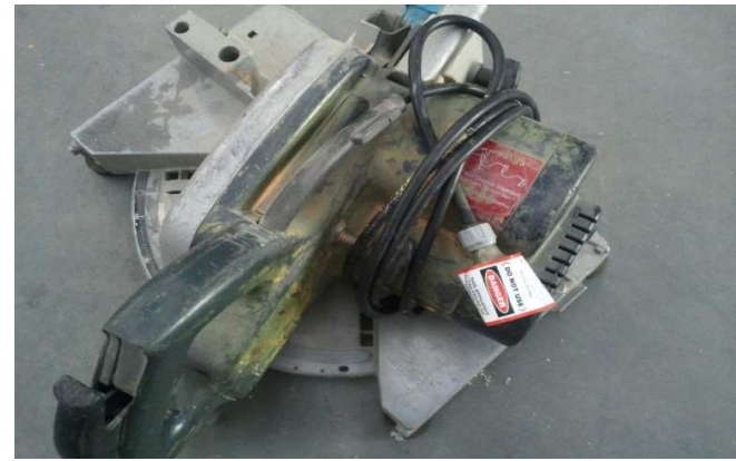
* Tag WS039 Drop Saw FAILED - Does not Power-up