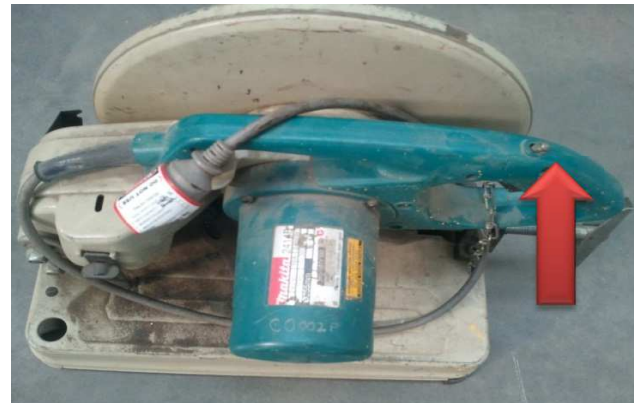
* Tag WS041 FAILED a Visual Inspection - Has a screw locking the top safety switch on