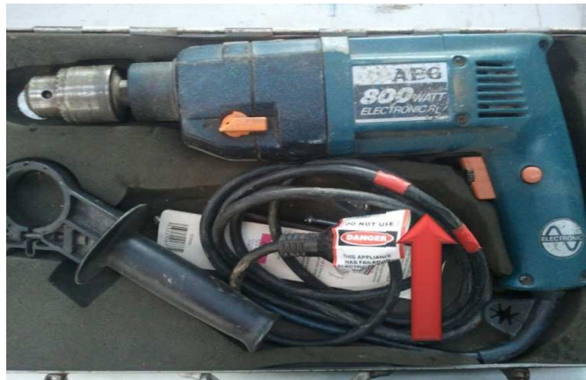
* Tag WS038 FAILED - Drill with a Damaged Lead