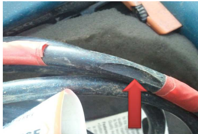
* Tag WS038 FAILED - Drill with a Damaged Lead