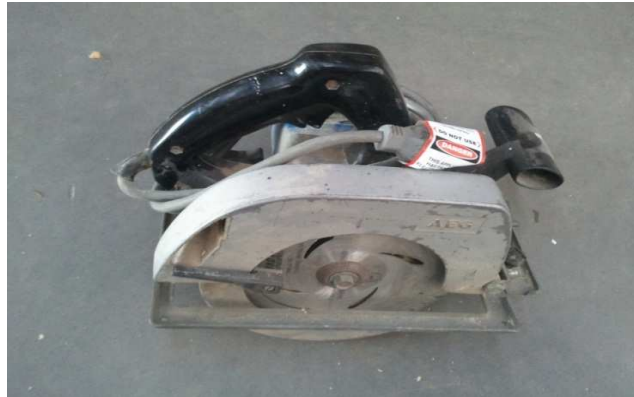
* Tag WS037 Saw FAILED - Damaged Lead