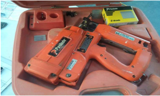
* Tag WS029 Unable to test - A/C charger missing